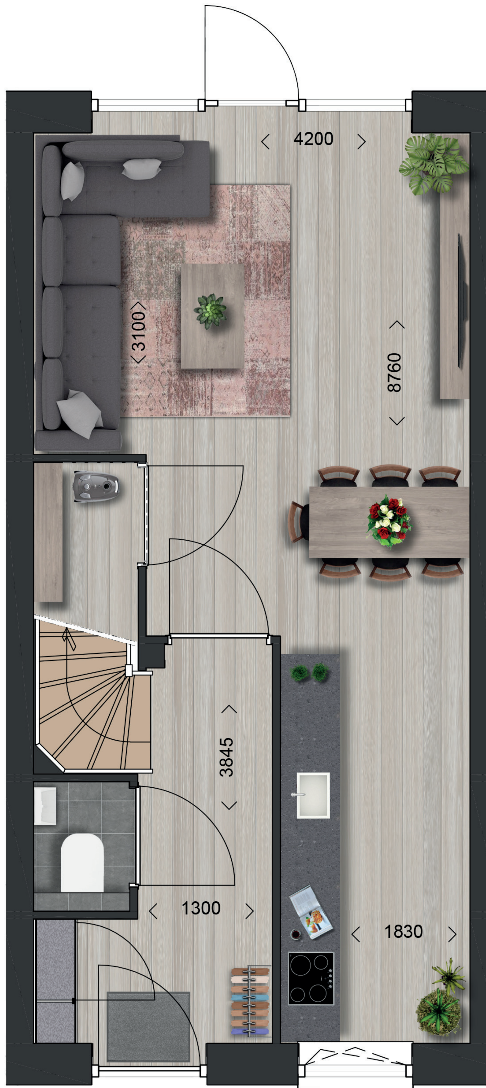
begane grond (gespiegeld)